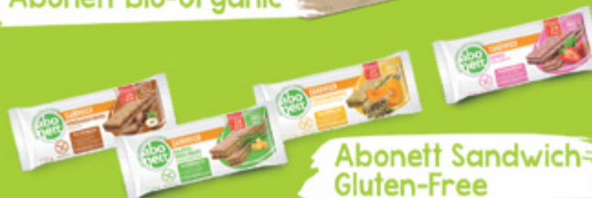
Abonett Sandwich Gluten-Free